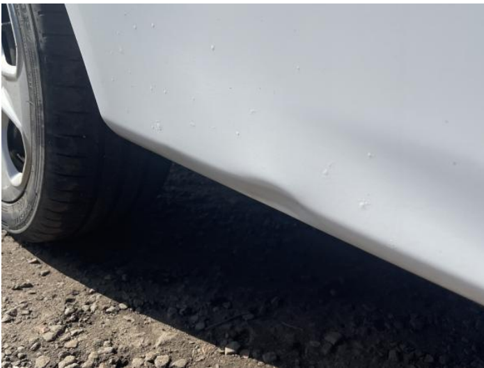
5: Qtr Panel osr Dented Over 30mm