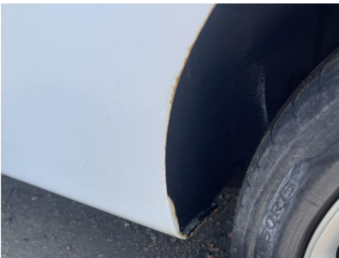
7: Qtr Panel nsr Rusted Over 5mm