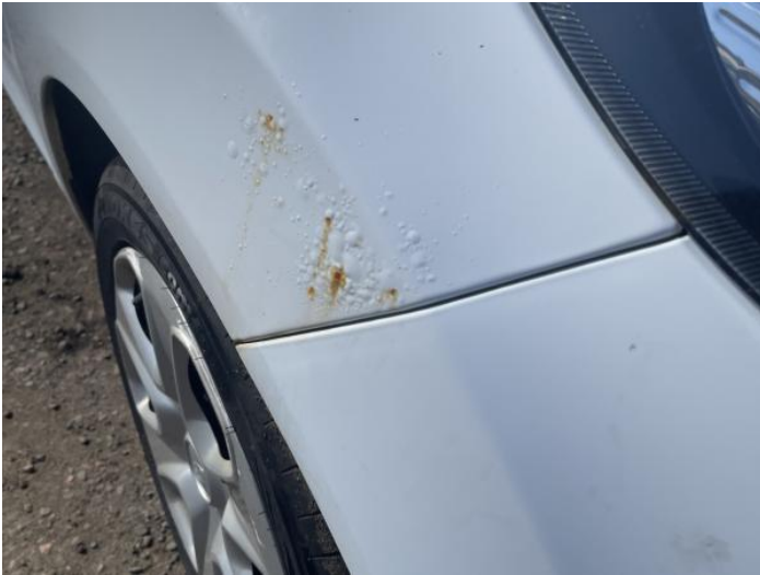
3: Wing osf Rusted Over 5mm