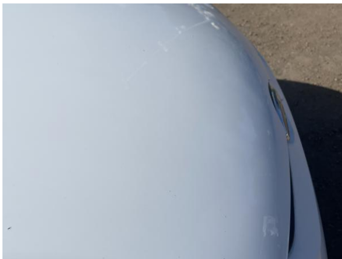
1: Bonnet Dented Over 30mm