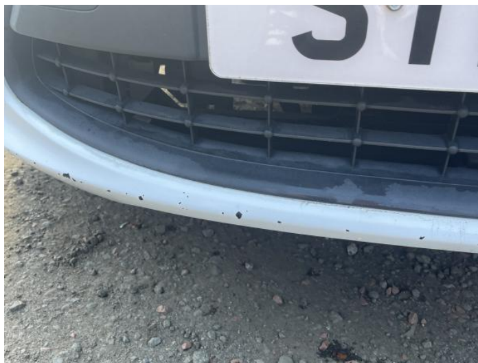
2: Bumper Front Chipped Multiple Chips