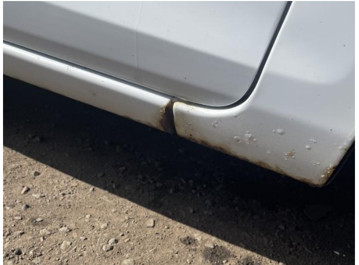
4: Sill os Rusted Over 5mm