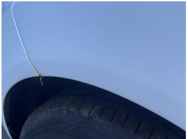
9: Door nsf Rusted UpTo 5mm