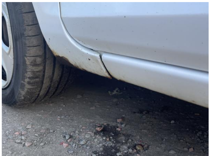
8: Sill ns Rusted Over 5mm