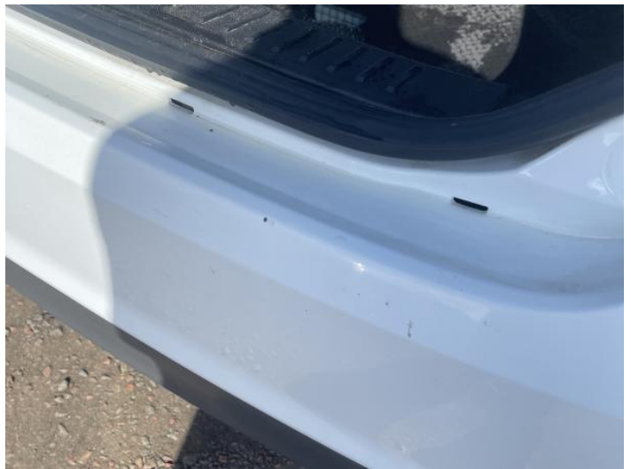
6: Bumper Rear Dented Over 30mm